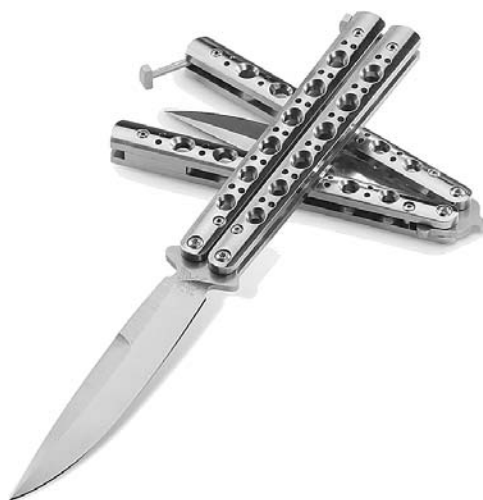
A BUTTERFLY KNIFE OPEN AND CLOSED 59

Butterfly knives, also known as balisongs, are sometimes named explicitly in state or local knife laws and are occasionally considered to fall within a state or local definition of “switchblade.” 58 A butterfly knife consists of two handle sections that, when the knife is closed, completely cover the blade.